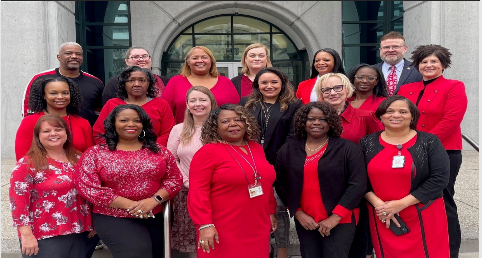
Board of Parole Central Office Staff wore red to raise awareness for heart health.

Why do we observe American Heart Month every February? Well, every year more than 600,000 Americans die from heart disease. The number one cause of death for most groups, heart disease affects all ages, genders, and ethnicities. Risk factors include high cholesterol, high blood pressure, smoking, diabetes, and excessive alcohol use.