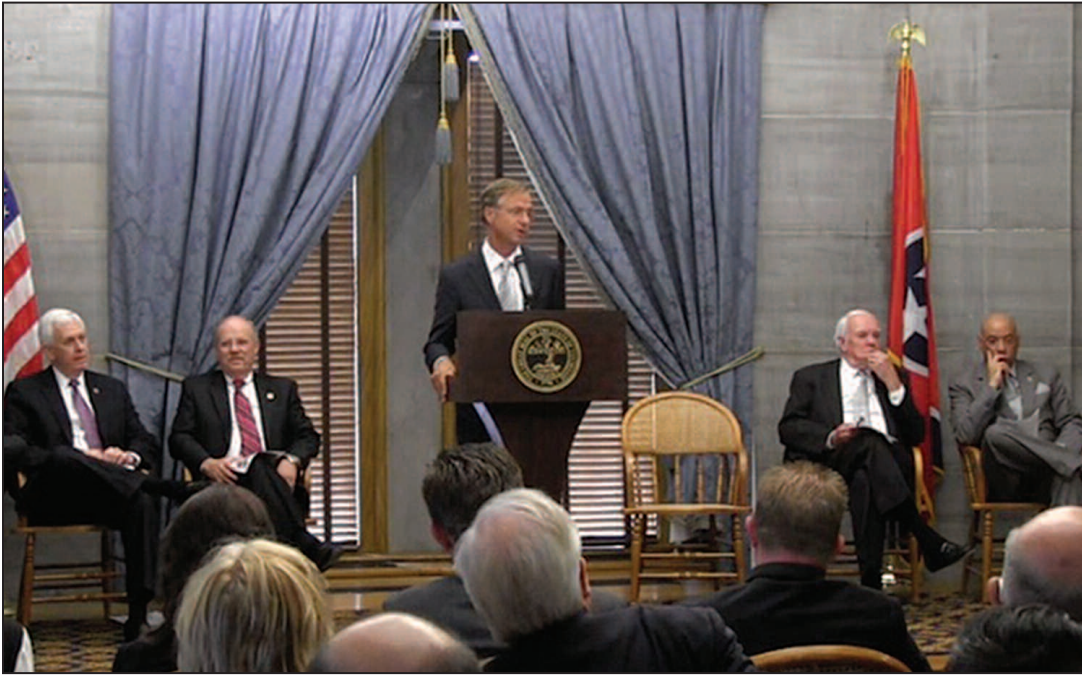
Governor Bill Haslam introduces the "Prescription for Success" plan June 3, 2014.

reducing infants' and children's exposure to secondhand smoke; and preventing child and adolescent tobacco use. There were 303 projects last year across Tennessee addressing one or more of these targets; 123 had school-aged children as the primary audience, 74 addressed smoking during pregnancy, 59 focused on problems with secondhand smoke and 41 were general messages about the health dangers of tobacco use.