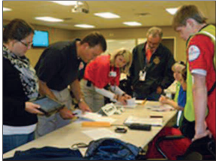
West Regional Office Emergency Preparedness Program and Henry County Health Department staff members participate in community assessment training with the Henry County Emergency Management Agency in March 2014.