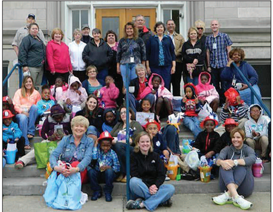
Mid-Cumberland Regional Office employees with students participating in their PPI tutoring project at Warner Elementary School, Nashville.

The NAS Subcabinet has developed strategies to address NAS including: enhanced education for health care providers to encourage conversations with women of childbearing age about the potential dangers of using certain drugs during pregnancy; discussing family planning options and encouraging their use until a woman is not using certain drugs; specialized treatment services for mothers with opioid addiction whose babies have been born with NAS; and developing best practices for opioid detoxification of pregnant women.