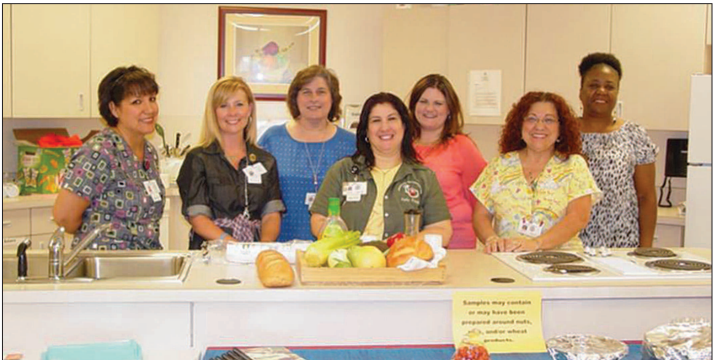
The Montgomery County Health Department Obesity Primary Prevention Initiative Team hosts a "Health Expo" for community members and coworkers in Clarksville.

These important newborn screenings are not the first contact a person may have with the Tennessee Department of Health. Even before birth, TDH likely