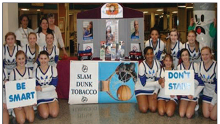
McNairy County Health Department staff members partner with McNairy Central High School basketball players and cheerleaders to "Slam Dunk Tobacco" at games in January 2014.

To be eligible for tobacco settlement funds, the county-level work had to focus on one or more of three targets: eliminating smoking during pregnancy;