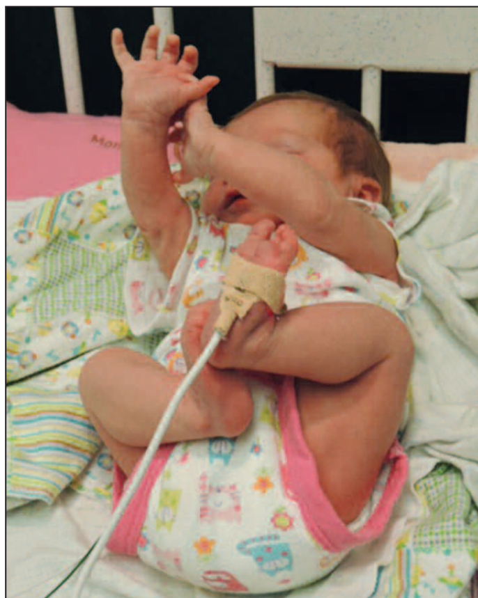
A newborn is treated for Neonatal Abstinence Syndrome at East Tennessee Children's Hospital in Knoxville

TDH made NAS a reportable condition effective Jan. 1, 2013. In that year, 936 NAS cases were reported. In 2014, 1,018 newborns in Tennessee experienced NAS. The case rate in 2014, 12.7 cases per 1,000 live births, was slightly higher than the case rate of 11.7 per 1,000