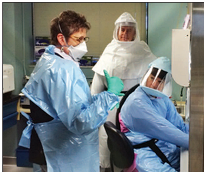
TDH Executive Team members and laboratory staff practice personal protective equipment use at the State Public Health Laboratory in Nashville in October 2014.

Fear and concern were the initial, natural reactions for many Americans. But those on the national and state public health fronts, accustomed to running toward an emergency situation, had already started preparations to simultaneously contain the deadly virus and to safely care for anyone who might become infected. While there was limited domestic familiarity