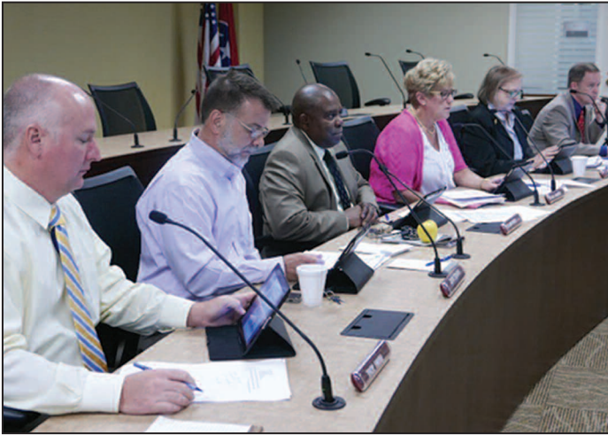
The Tennessee Board of Respiratory Care is one of 36 Health Professional Boards that oversee licensure and regulation of the state's health professionals.