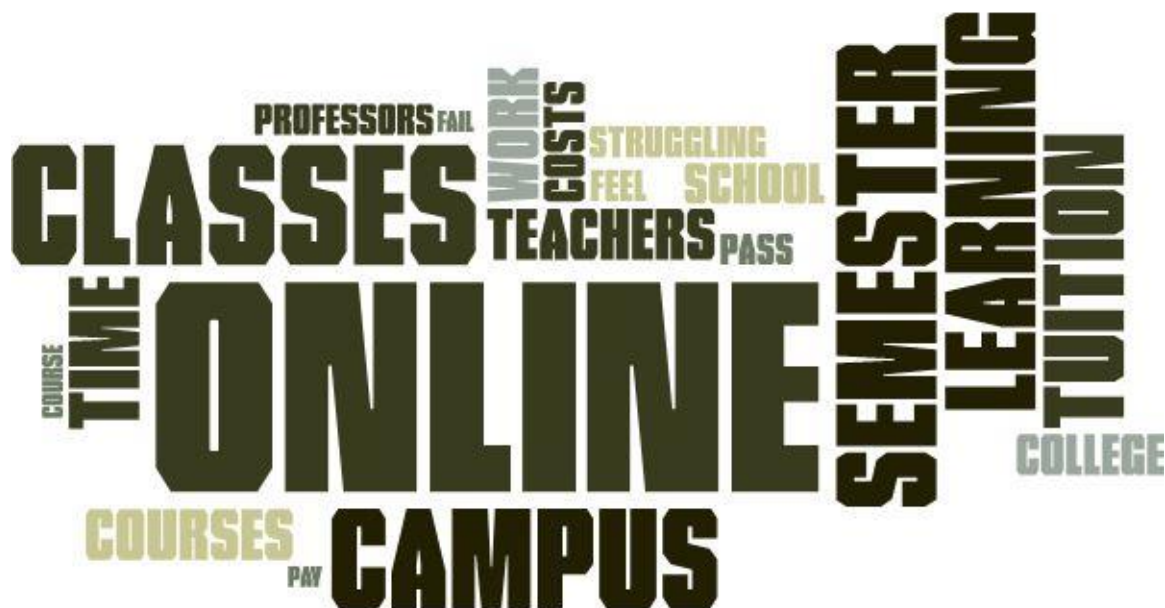
Figure 3. Word cloud of open-ended survey responses to the question, “Based on your situation, what could your college do to better support you?”

In general, students indicated a need to improve their online/distance education experience. This was consistently referenced as the greatest need for improvement across