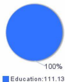
Table 1: MSYs by Focus Areas