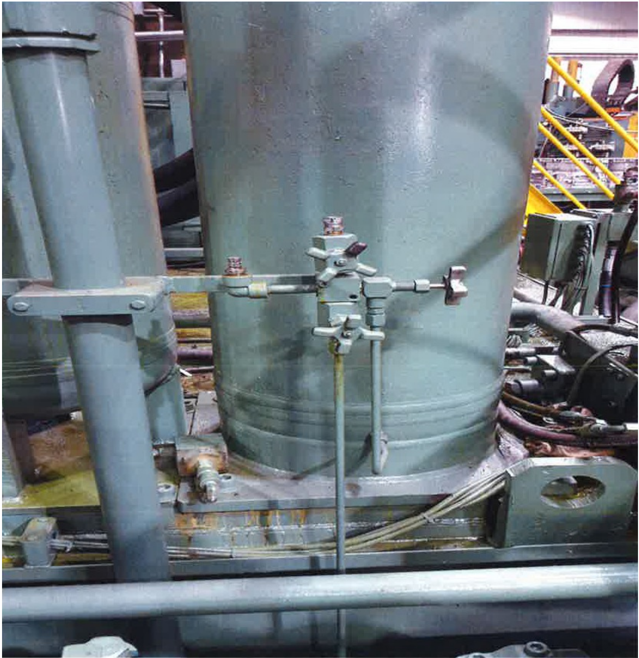
Photo 3 of 4 – Photo shows the drain valves near the bottom of the nitrogen bottle on the #80 die cast machine.