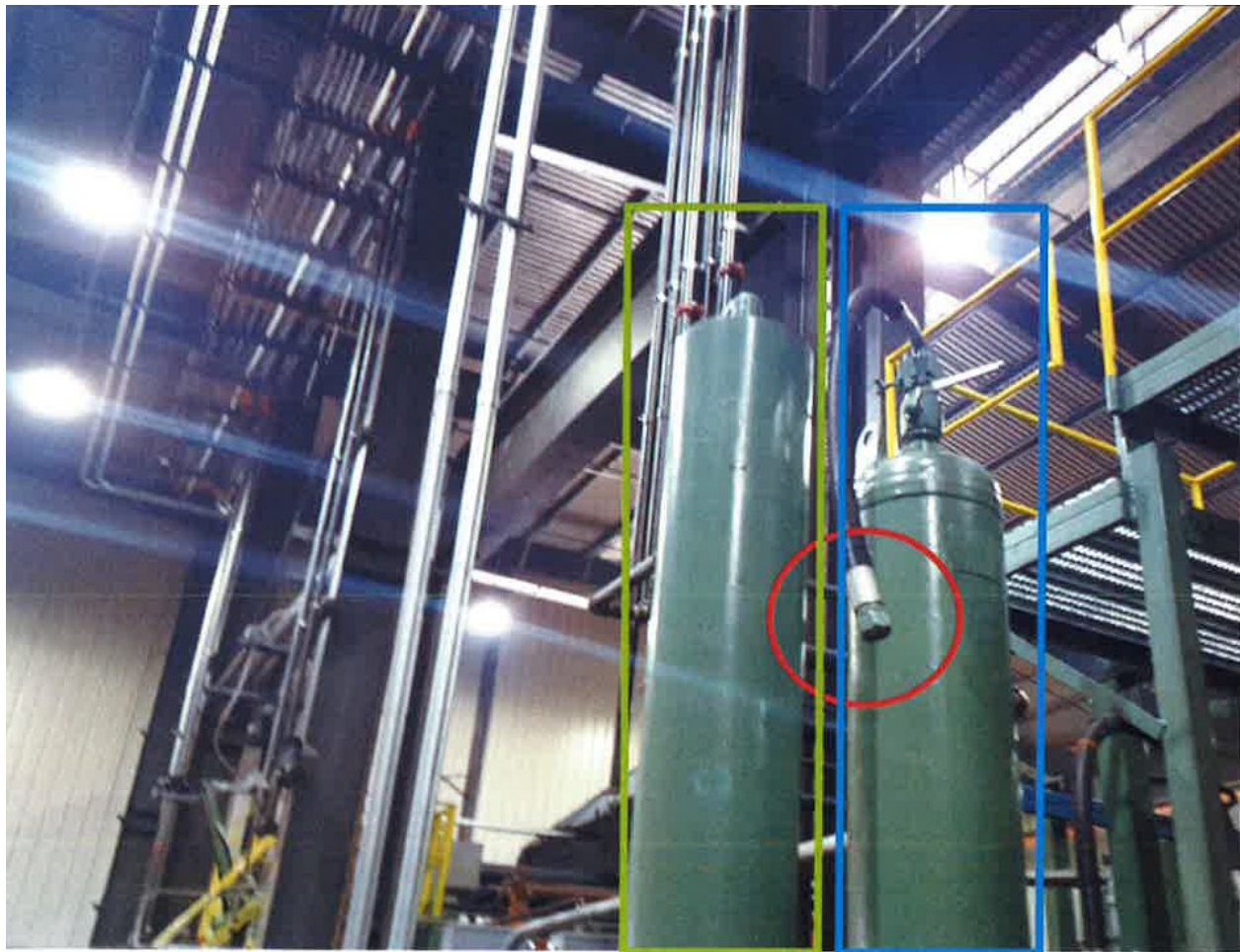
Photo 1 of 4 – Photo shows the #80 die cast machine. The nitrogen gas bottle is shown in the blue outline and the accumulator bottle is in the green outline. The red circle indicates the end of the hose that struck the victim.