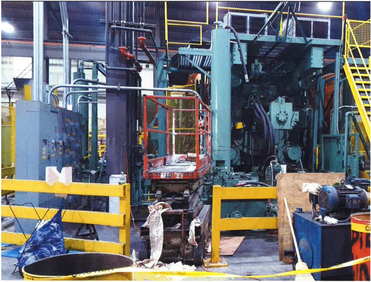
Photo 4 of 4 – Photo shows the scissor lift used to lift the victim to release the pressure at the top of the nitrogen bottle on the #80 die cast machine and remove the 4 foot hose