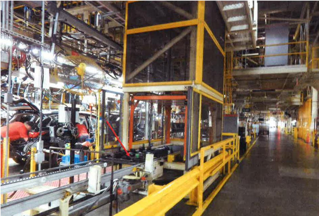
Photo 1 of 2 – Empty car seat pallet (red arrow) as it is entering the DL85 elevator to be transported up to the return conveyor.