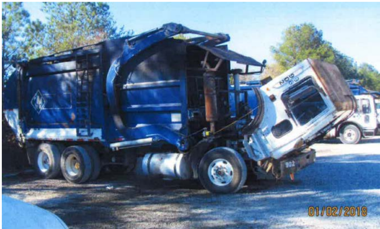
Photo 1 of 2 – Shows truck 902 with the cab in the fully tilted up position