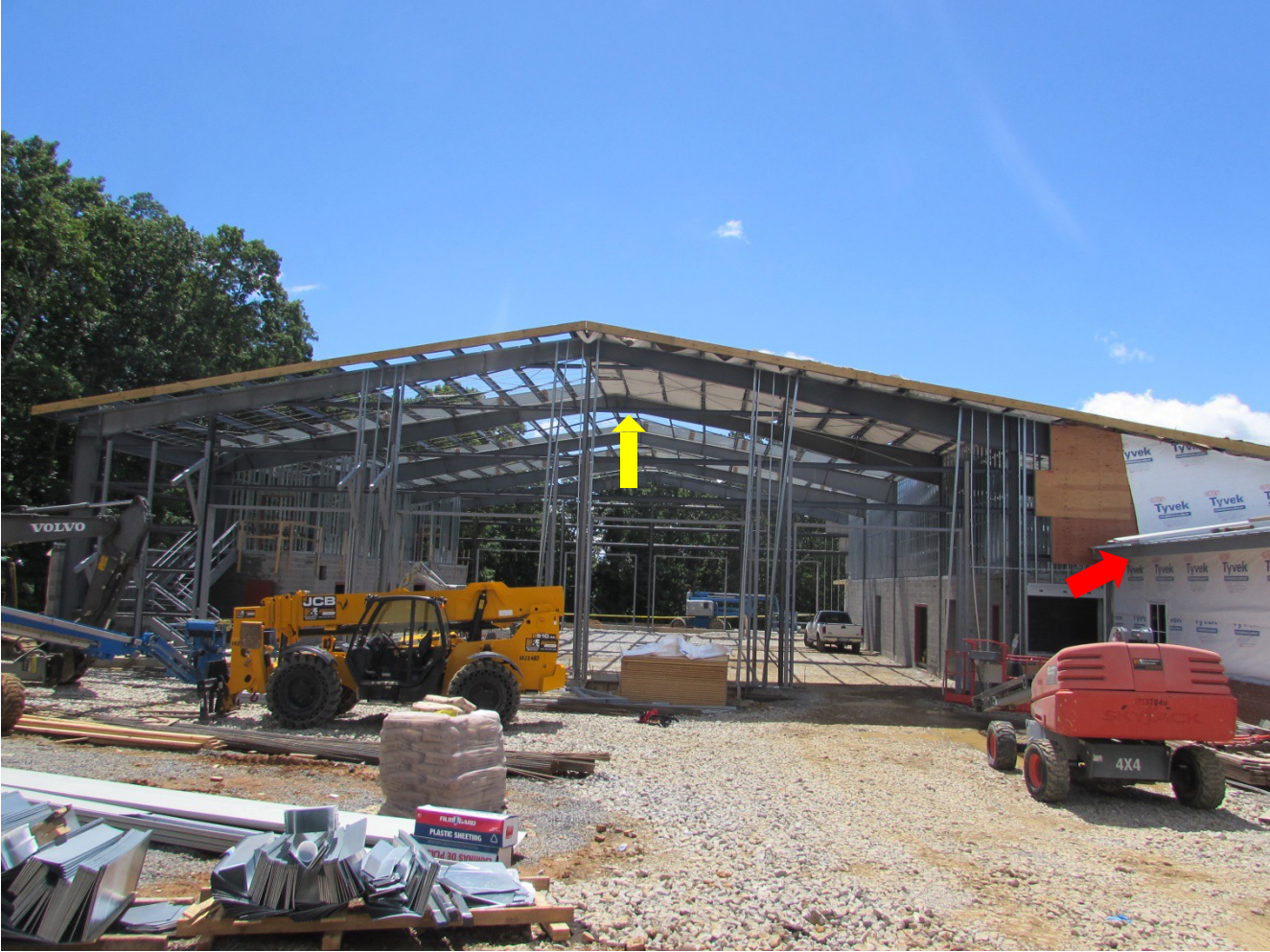
Photograph shows the east side of the construction site. The victim was working near the apex of the roof when he fell. The red arrow indicates the point of access to the roof. The yellow arrow indicates from where the victim fell.